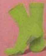
Santini Origine 365 socks £13

Middleweight socks that are light enough for summer yet not so thin as to leave you with cold feet when the temperature drops. Dryarn carbon inserts in the weave resist odours and the main Gskin fabric is fast drying, too.